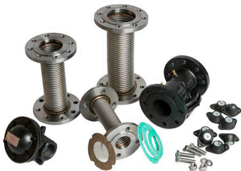
Installation Kit Included with all Package Gas Boosters.

Available as a Package or Stand-Alone system. Available packages overleaf.