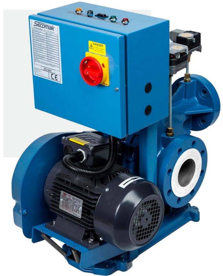
Product supplied may differ from image based on pressure requirements. Image represents Package Gas Booster including controls.